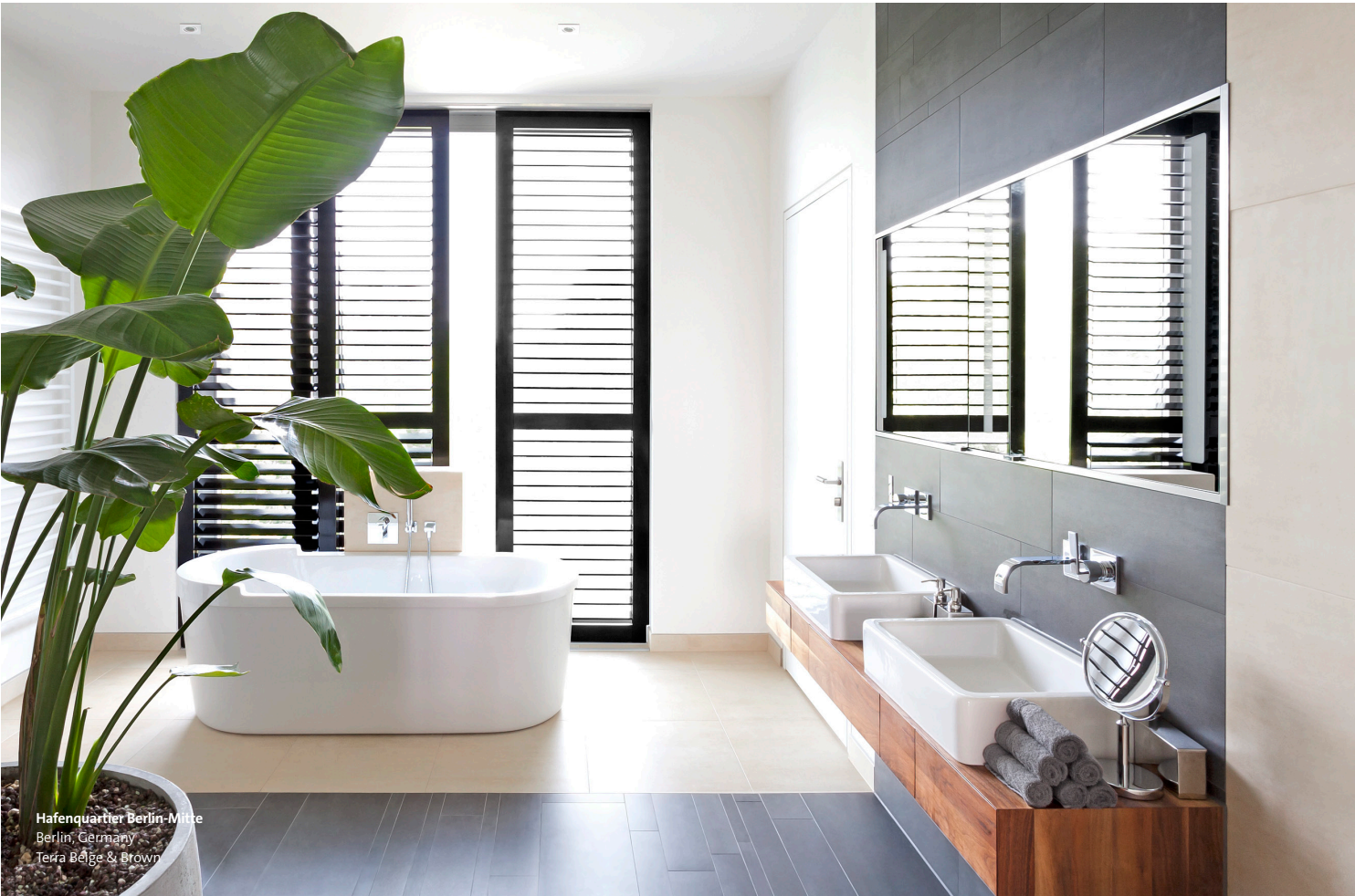
Hafenquartier Berlin-Mitte Berlin, Germany Terra Bêge & Brown