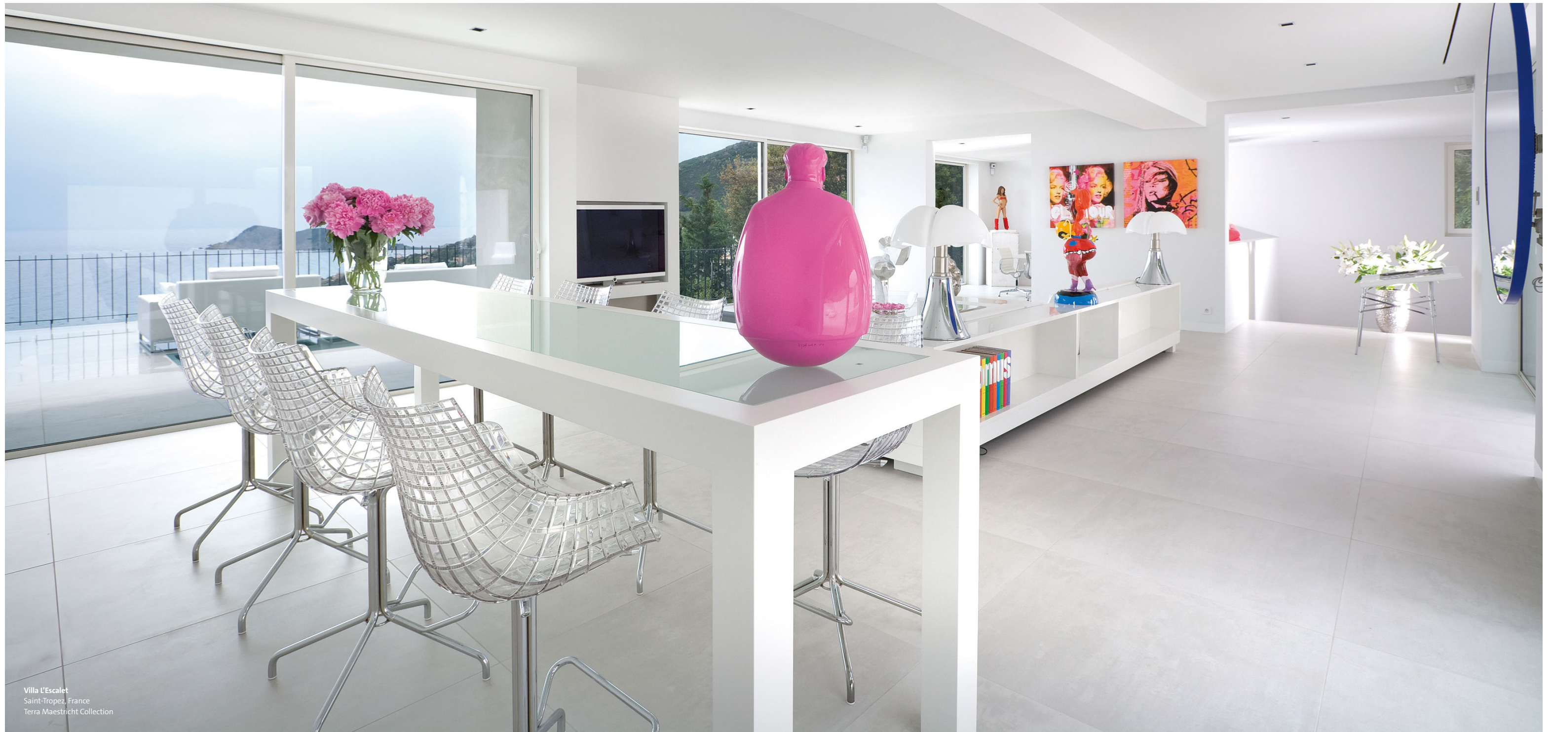
Villa L'Escalet Saint-Tropez, France Terra Maestricht Collection