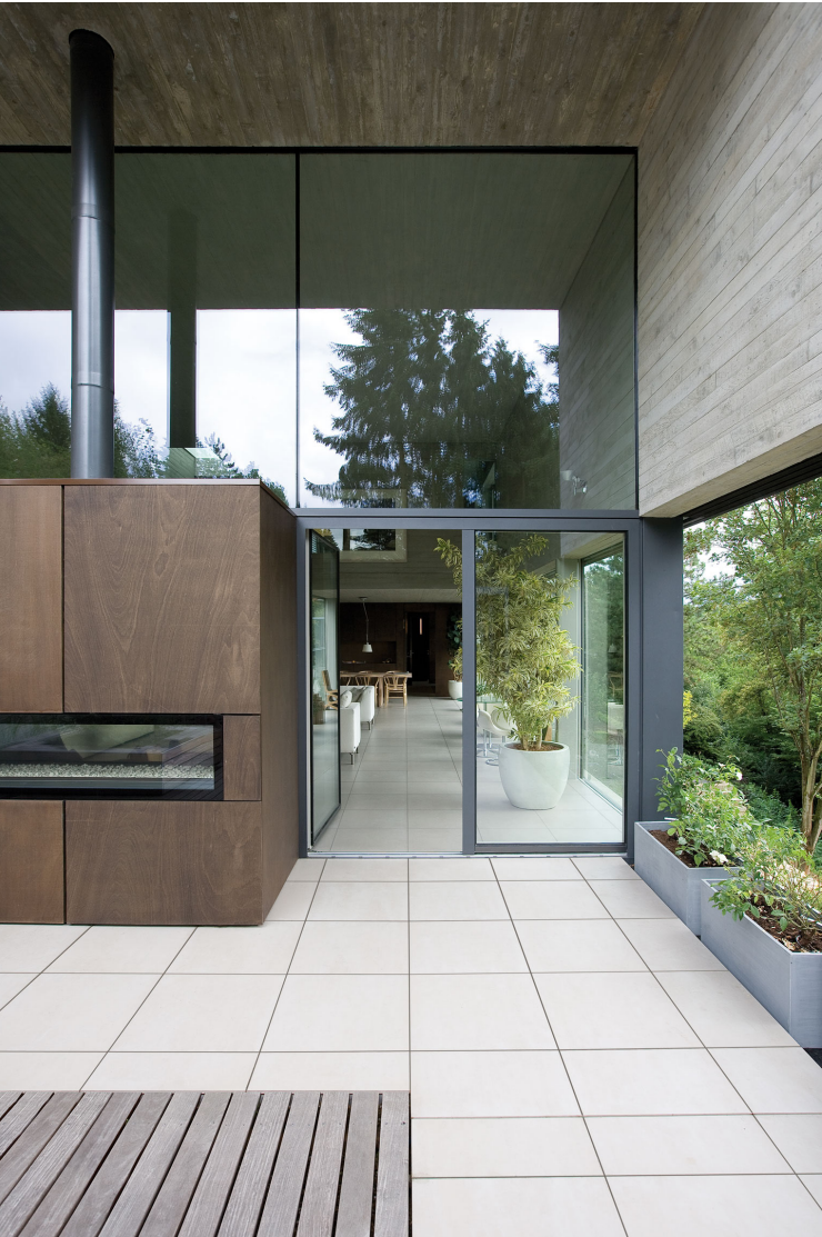
↑ Röling family private home Kudelstaart, the Netherlands Terra Maestricht Collection

Industry Standard: 250 lbs. Mosa Standards: Thickness < .04” > 400 lbs. Thickness > .04” > 700 lbs.