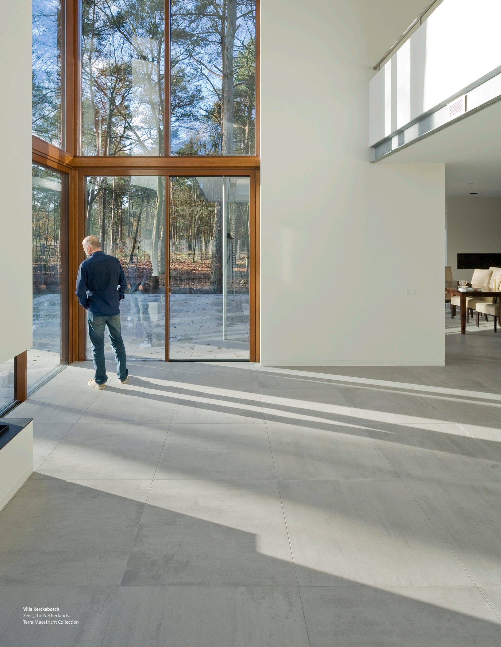
Villa Kerckebosch Zeist, the Netherlands Terra Maastricht Collection

When you want a design to soar, there's no substitute for a firm foundation. Mosa floor tiles provide a beautiful, immersive surface that feels organic and appears ever-changing. You can enjoy a rich design process while using materials that are sustainable and perform to perfection. In choosing Mosa, you offer your residential clients the same award-winning tile innovations that are trusted by renowned design minds and installed in epic structures across the globe. Plus, with hundreds of colors and myriad sizes in wall tile, and Mosa's online pattern generator, the design possibilities are endless. Our experts can help you create residential environments that are the very definition of your vision and your client's dream.