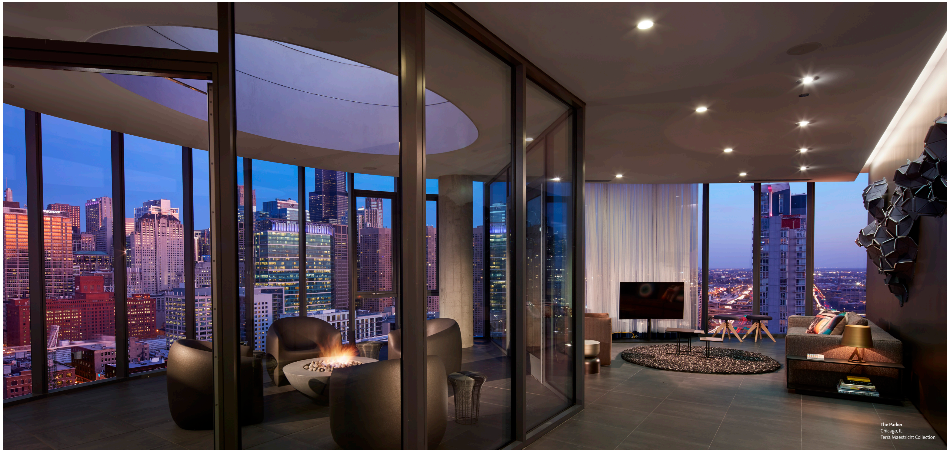
The Parker Chicago, IL Terra Maestricht Collection