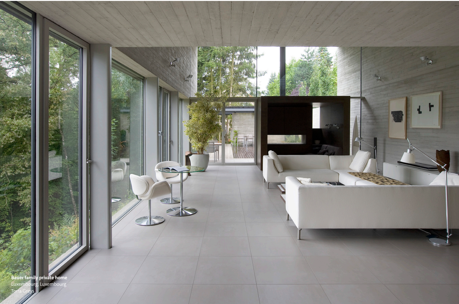
Bauer family private home Luxembourg, Luxembourg Terra Greys